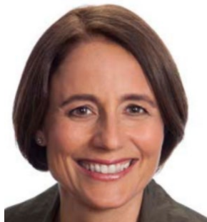
PRINCIPAL / MANAGING PARTNER