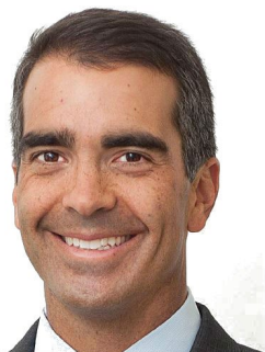
CEO, FOUNDER / MANAGING PARTNER