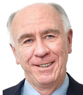
PRINCIPAL / COMPLIANCE OFFICER