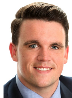
DIRECTOR OF INVESTMENT RESEARCH